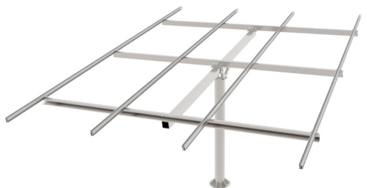
Pole Mount 8#