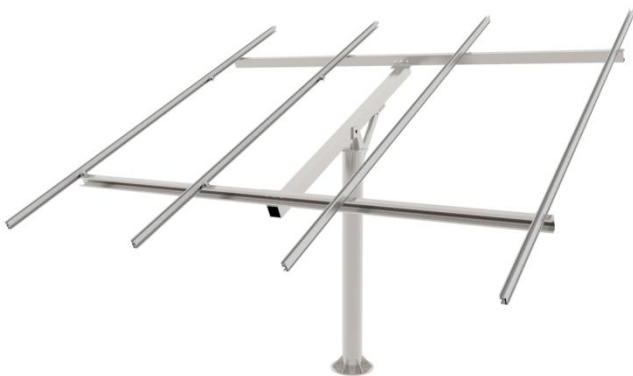
Pole Mount 6#